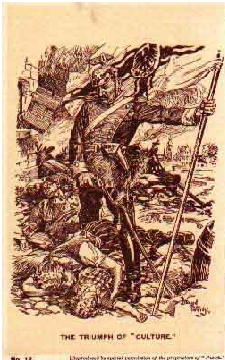
THE TRIUMPH OF "CULTURE."