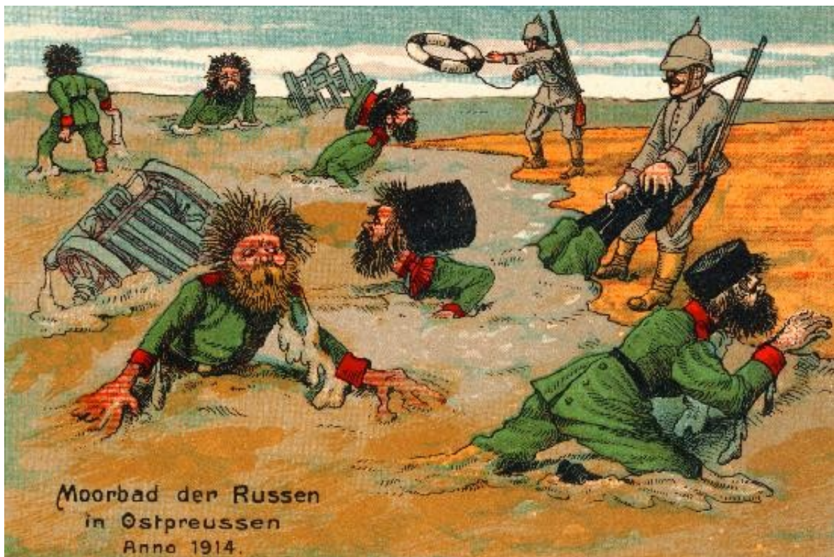
The Russians are taking a bath in the swamps of East Prussia 1914.