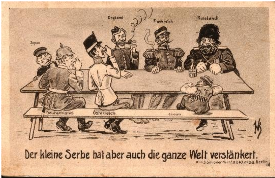
The little Serb is poisoning the whole world.